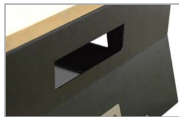
Handle To Transport