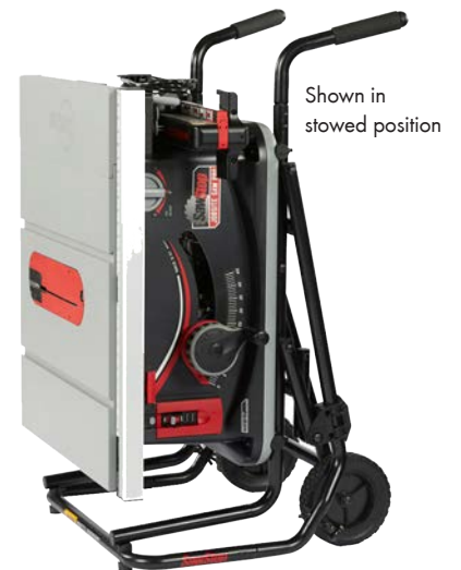
Shown in stowed position