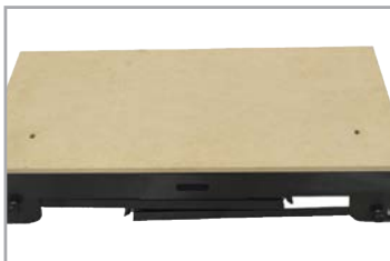
Retractable Feet and Wheels