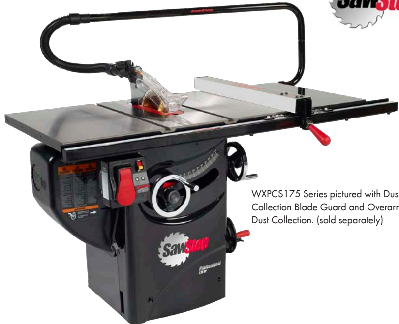
WXPCS175 Series pictured with Dust Collection Blade Guard and Overarm Dust Collection. (sold separately)

Free Shipping from Würth Baer Supply warehouses!