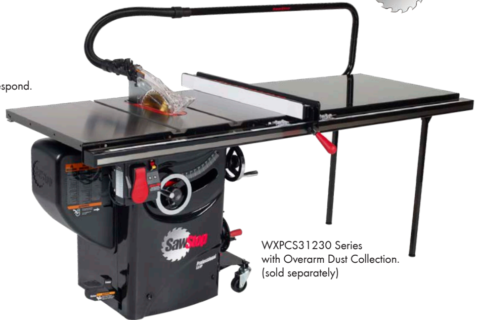
WXPCS31230 Series with Overarm Dust Collection. (sold separately)

Does not plug into a standard 120V outlet.