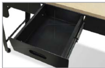
Drawer To Store Accessories