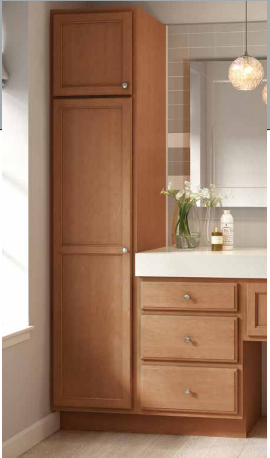
SEACREST BIRCH IN MIRAGE